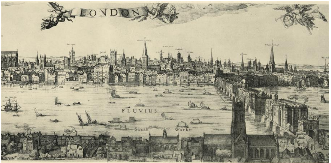
Detail from Visscher’s View of London, 1616

We will be looking at the times, the man, as well as the plays and the background to them, as much as possible. It is hard after 400 years plus to be sure about anything even if the plays we know today were the ones performed in Shakespeare’s time but the man and his plays continue to fascinate scholars and